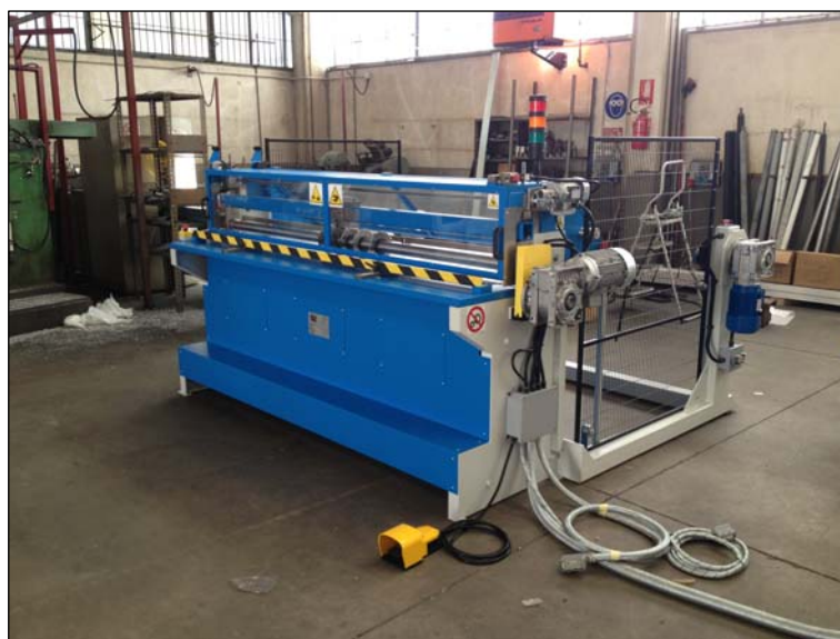
Multi blade slitter machine